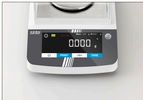
The modern touch display enables convenient operation