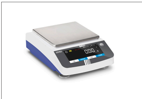
Also available with a larger weighing surface