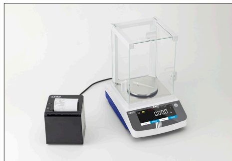
In a GLP-compliant print protocol all weights can be documented, including date, time and identification number.