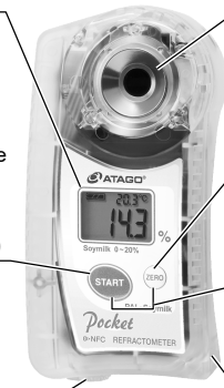
Image is for explanation purposes only. It may be different than the actual product purchased.