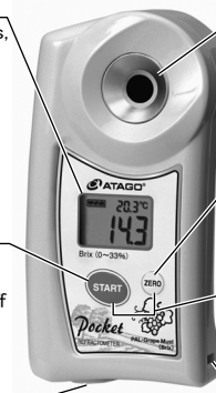
Image is for explanation purposes only. It may be different than the actual product purchased.