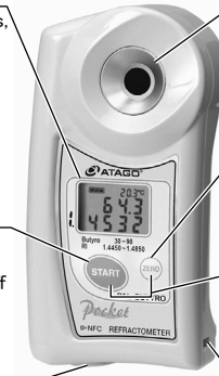
Image is for explanation purposes only. It may be different than the actual product purchased.