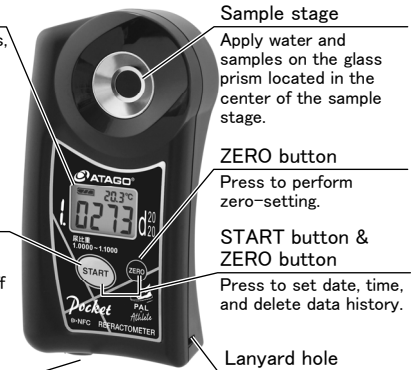
Image is for explanation purposes only. It may be different than the actual product purchased.

Trouble scanning the code? Access this link https://www.atago.net/ur/index.php?l=en