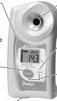
Image is for explanation purposes only. It may be different than the actual product purchased.