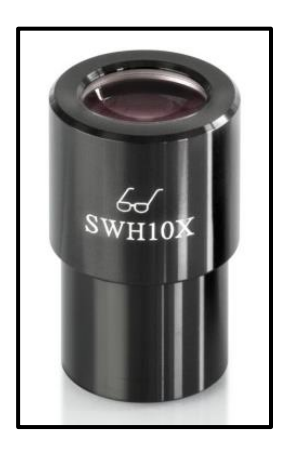
High Eye Point eyepiece (identified by the glasses symbol)