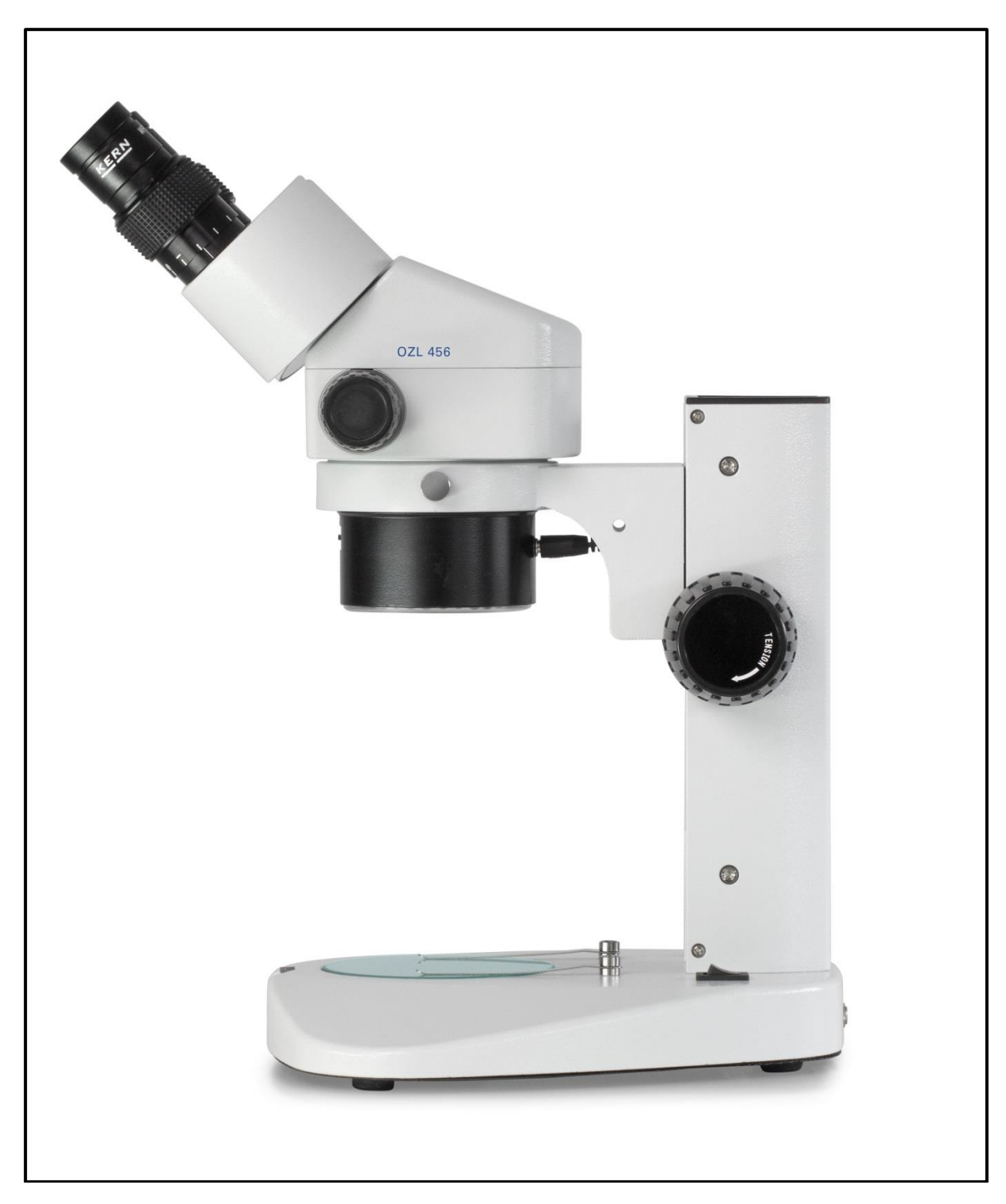
Assembled stereo zoom microscope