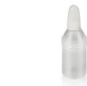
Calibration liquid/Contact liquid