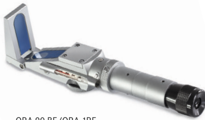
ORA 90 BE/ORA 1RE