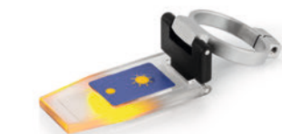
Prism coverplate with LED ORA-A1101