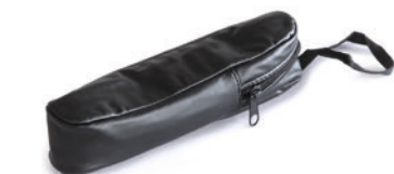
Leather bag ORA-A2103